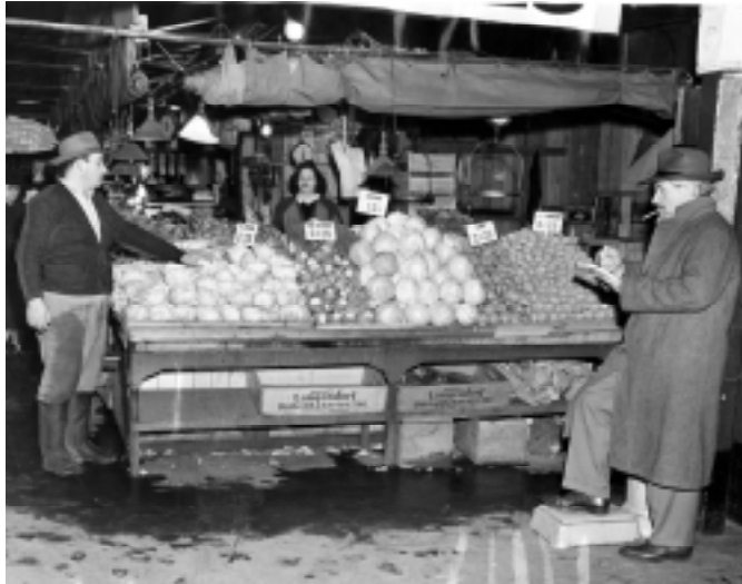
Mark Tobey sketching at the Pike Place Market, Seattle

As an art teacher Tobey was exceptional. ‘Many of his students from both the Cornish School and his private classes have testified that he was a masterful teacher.’ 8 He encouraged the development of his students’ vision, their sense of aesthetics. He had them look and observe. He took his classes into Seattle’s Volunteer Park and had his students collect leaves, twigs, moss and other verdure they thought were interesting. He encouraged them to pay particular attention to the veins in leaves, a patch of matted grass, a stone or wet